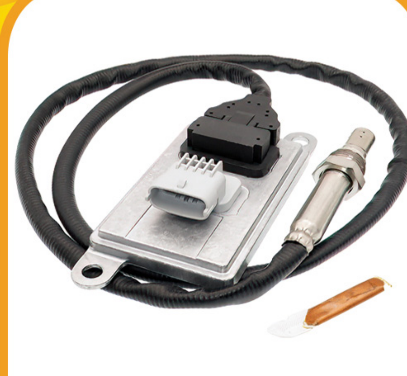
Sensors FORD, GM CUMMINS INTERNATIONAL