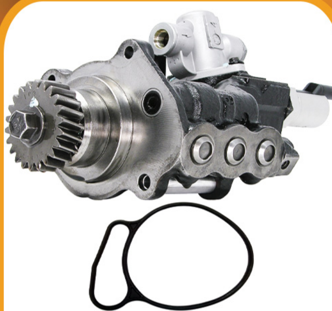
High Pressure Oil Pump FORD INTERNATIONAL