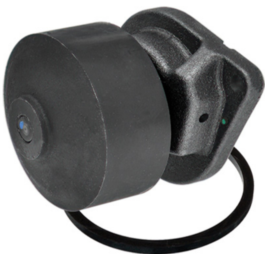
Water Pumps CAT, FORD, GM CUMMINS INTERNATIONAL