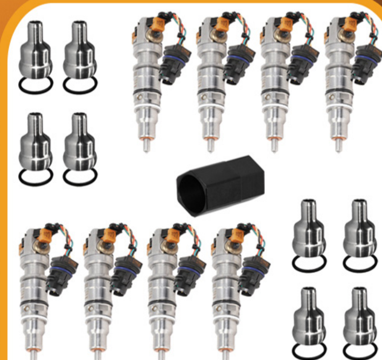
Injectors CAT, FORD, GM CUMMINS INTERNATIONAL