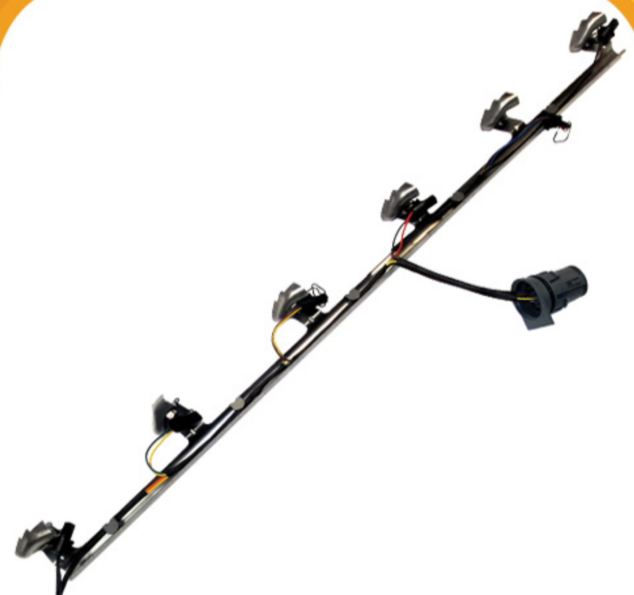
Harnesses FORD CUMMINS INTERNATIONAL