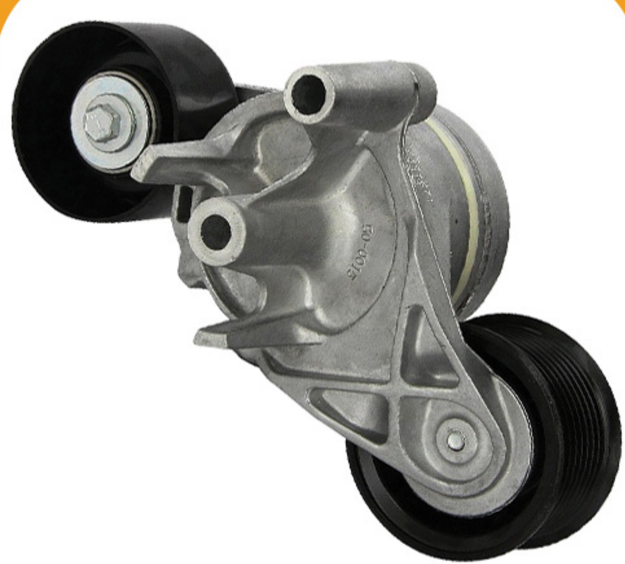
Tensioners FORD, GM CUMMINS INTERNATIONAL